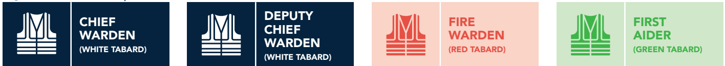
Figure 1: Incident Response Team Member Identification

Tenants must provide suitable Fire Warden Representatives for their tenancy to provide adequate coverage during the Tenant's normal operating hours. The Tenant Fire Warden Representative/s must be available to be trained by Curtin to enable them to direct fellow employees, customers, visitors and contractors during an emergency situation.